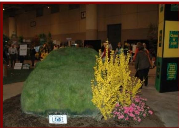
Ontario's turf industry display— a car covered in living grass

Blooms. The number of visitors to the show seemed to be on par with last year. The March break scheduling of the show (for both 2008 and 2009) greatly increased the number of youth attending the show.