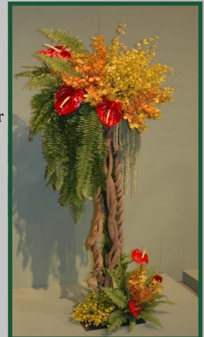
An award winning floral design at Canada Blooms

The number of exhibitors was down this year as a result of the economic downturn and the considerable expense associated with running a booth downtown Toronto. Most of the displays this year were confined to the 800 level of the MTCC. Our university's booth was also downsized from 3 booths to one in an effort to have a more cost effective presence at